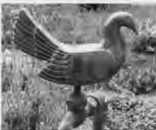
Bronze phoenix bibcock, on the restoration list at Garland Farm.