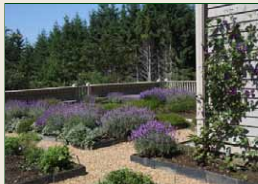
Terrace Garden, July 2010