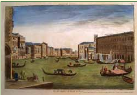
Perspective view of Venice