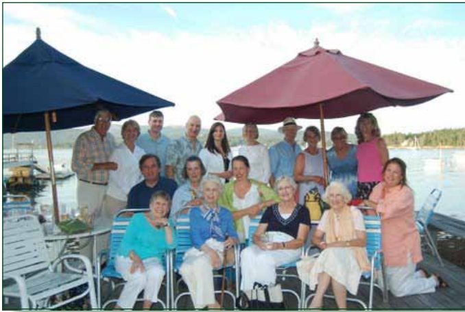
Beatrix Farrand Garden Association, July 2010

2010 was a banner year for visitors to Garland Farm. As word continues to spread about the garden rehabilitation, over 200 visitors from the US, Canada, and France traveled to Maine to see Beatrix Farrand's last home and garden and enjoy the docent-led tours. One of the most frequently asked questions was, "Why did Beatrix Farrand demolish Reef Point?" Visitors were most curious about the circumstances surrounding Farrand's stay at Garland Farm, her education, and the work in the garden. As always, a number of experts among visitors contributed to the knowledge of Garland Farm.