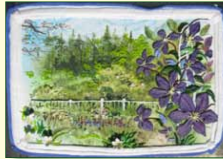
Terrace Garden cake