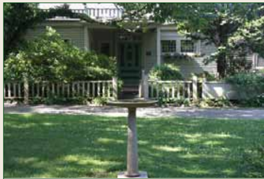
Birdbath, July 2010 Carolyn Hollenbeck

There has also been substantial work completed outside the Terrace Garden. Thanks to the generosity of Jim and Emily Fuchs, three new ornamental cherries ( Prunus x 'Accolade' ) were planted on the southern embankment. Added to the existing cherries, these new plantings create a discernable terminus to the Terrace Garden. A new Florida dogwood ( Cornus florida ), donated by the Garden Club of Mount Desert, was planted in the east corner of the terrace, where an invasive stand of the aggressive shrub Sorbaria sorbifolia was removed.