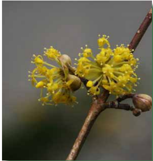
Cornus mas flower cluster Carolyn Hollenbeck

In late March or early April, showy bright-yellow flower clusters, attached to nodes of first-year wood or short spur shoots on older wood, burst from small, globular, pendulous bulbs, heralding the arrival of spring. Glossy dark green leaves that are opposite, simple, and elliptic appear after the blooms have faded. Immature green fruits, containing a small drupe, turn red in July and are edible when their color becomes dark maroon. Fruits have an acidic flavor that has been described as a mixture of cranberry and sour cherry.